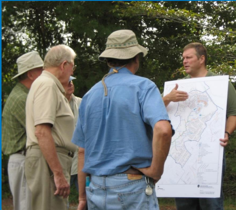
Mill Creek Watershed Tour 2011