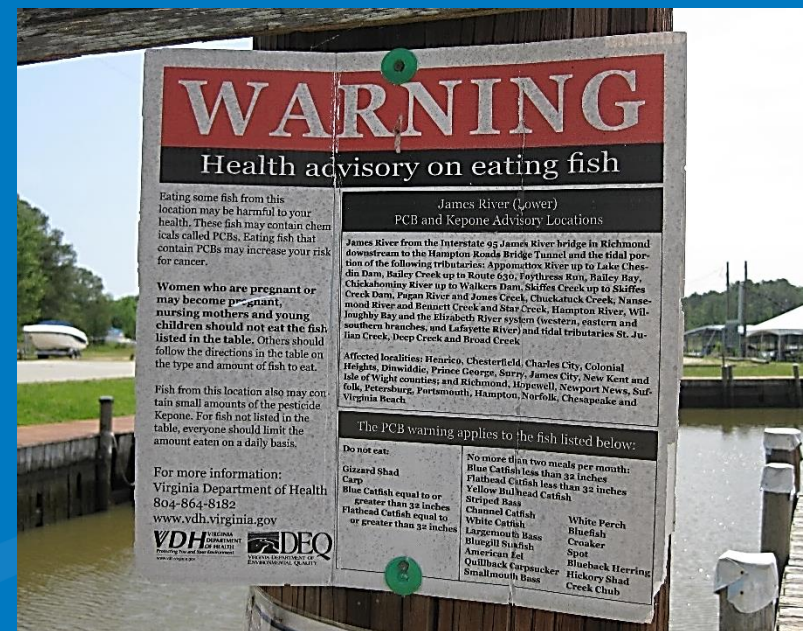
Fish Consumption Advisory Jamestown Marina