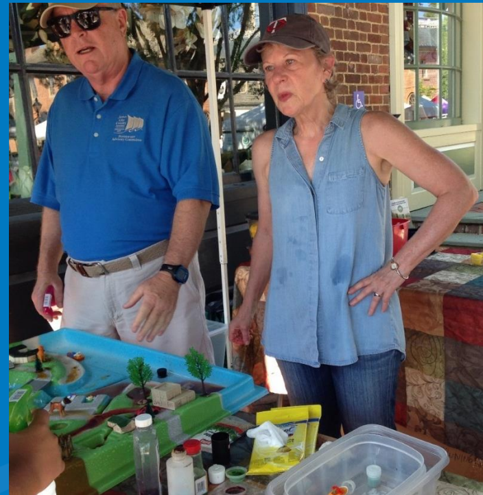
EnviroScape Demonstration at Williamsburg Farmers Market, 2017