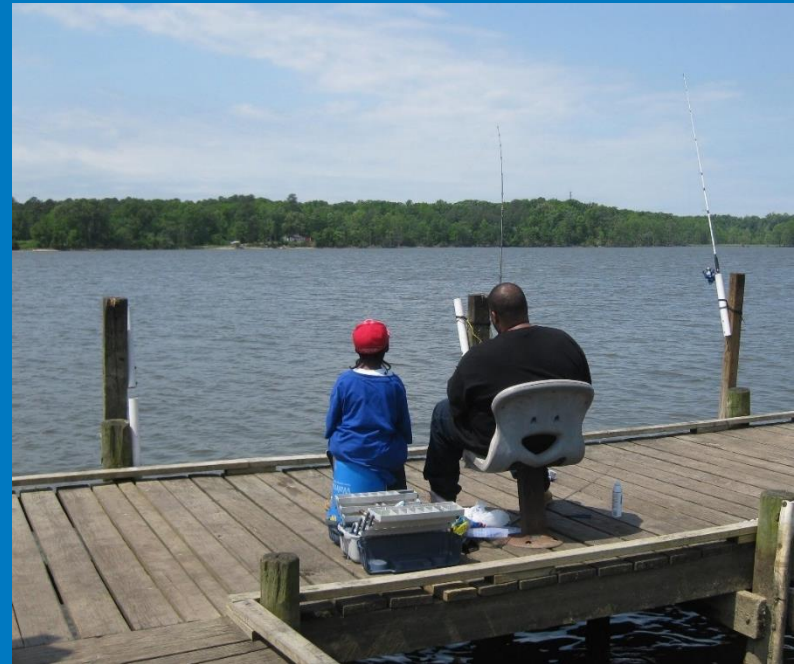
Fishing at Chickahominy Riverfront Park